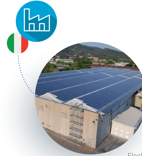
Fleck production site in Pisa, Italy

From the 70s, Fleck valves (except 5800 valve) have been assembled in Europe in order to better serve the european customers. Today, the production is located in our European center of expertise for valves in Pisa, Italy, where Autotrol and Siata valves were already assembled.